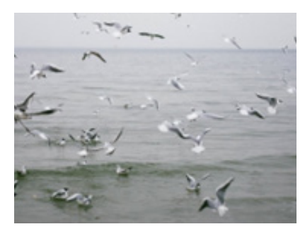
Seabirds live near the ocean.