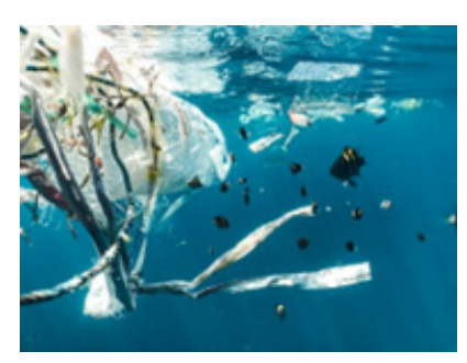
Plastic trash floats to the surface.