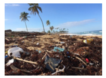
Plastic washed up on shore.

Did you know there are 5.25 trillion pieces of plastic in the ocean? Plastic litters the <u>deep ocean</u> and floats to the <u>surface</u>, <u>washing up on shores</u>. Plastic trash in the ocean kills <u>seabirds</u>, fish, <u>marine animals</u>, and <u>plant life</u>.