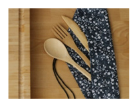
Reusable (non-plastic) items.