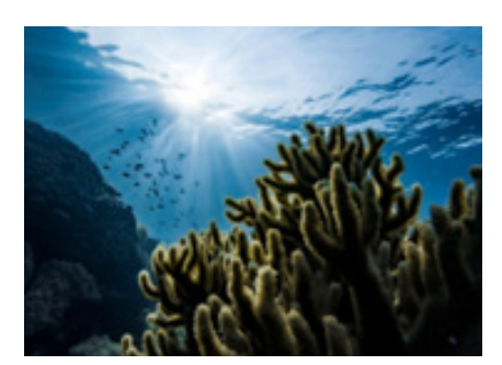
Marine plant life.

Did you know there are 5.25 trillion pieces of plastic in the ocean? Plastic litters the <u>deep ocean</u> and floats to the <u>surface</u>, <u>washing up on shores</u>. Plastic trash in the ocean kills <u>seabirds</u>, fish, <u>marine animals</u>, and <u>plant life</u>.