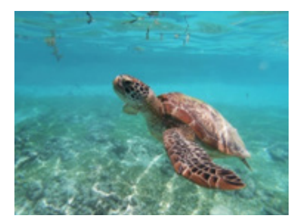
Fish and marine animals.

Many <u>companies</u> continue to make plastic <u>items</u> that get thrown away and end up in the ocean. People can make a difference by refusing to use plastic. Things like plastic forks, spoons, straws, or wrappers are unnecessary because <u>reusable</u> items can be used instead. The next time you are offered plastic, think about the harm it could cause...and don't use plastic!